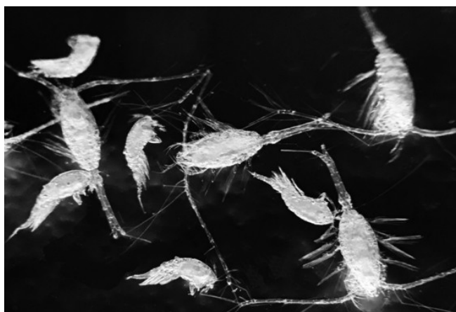
A variety of marine copepods who may play an important role in the seasonality below the surface.

atmospheric carbon dioxide, otherwise known as the biological carbon pump. The study, published in Global Biogeochemical Cycles , doi.org/10.1029/2021GB007101 , found that seasonality plays an important role in keeping carbon out of the atmosphere.