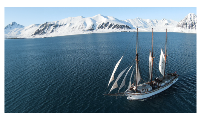
The Linden in icy waters.

Brewery and Henri Lloyd. Travelling to seldom-visited areas of the Ocean each year between June and October, Ocean Warrior intends to cover 10,000 nautical miles each year, over the next ten years, collecting data on a range of key 'indicators', in areas such as water quality, plankton, eDNA, salinity and ocean acidity. This will help scientists gain a clearer understanding of the pace of change taking place, their impacts on marine ecosystems, and what the future may hold for the Arctic region and the wildlife, populations and economies which depend upon it, www.pml.ac.uk/News/Arctic-bound-The-Ocean-Warrior-project-prepares-to.