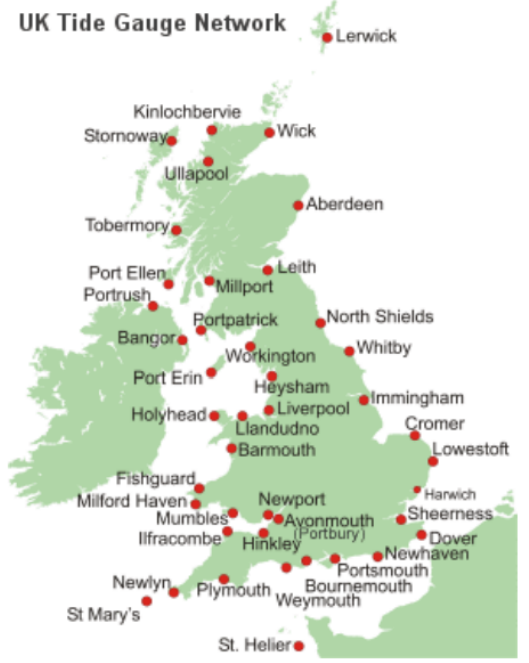
All 42 tide gauges across the UK.

sympathetically maintaining the legacy sensors to maintain the long-term data record. OceanWise achieve this by providing maintenance, systematic improvements and quickly responding to any ad hoc faults that might arise.