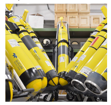
UPSCALING MARINE AUTONOMY IN THE UK A REPORT BY THE UPSCALING AUTONOMY WORKING GROUP OF THE NOC ASSOCIATION AND THE CHALLENGER SOCIETY FOR MARINE SCIENCE

Challenger Society for Marine Science formed the ioint Upscaling Autonomy Working Group (UAWG). The UAWG ran a series of information webinars. followed by a consultation, on the future shape of upscaling of marine autonomy in the UK. thanks With to